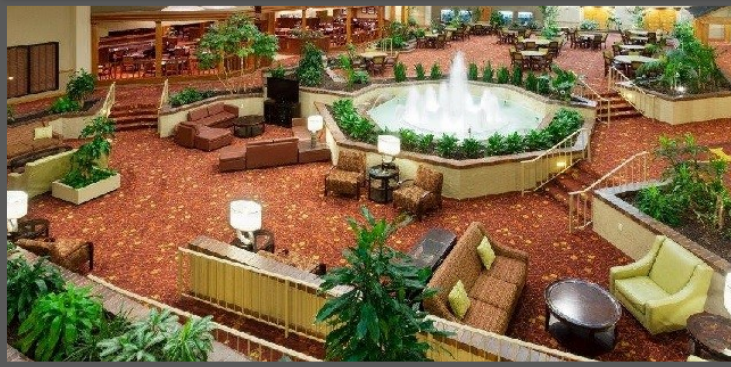
Holiday Inn Cincinnati Airport