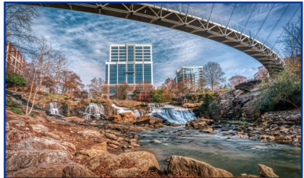
Liberty Bridge at Falls Park on the Reedy River in Downtown Greenville

ECA's 2024 International Conference will be held July 16-18 at the Greenville Marriott, Greenville, South Carolina. Nestled in the foothills of the Blue Ridge Mountains, Greenville offers visitors a unique blend of traditional Southern charm and contemporary cool you won't find anywhere else. Its award-winning, walkable downtown is packed with cultural and culinary attractions. The nationally recognized, tree-lined Main Street buzzes with people, locally owned boutiques, and 200+ inventive restaurants. The bustling art scene is alive through theater productions, street musicians, galleries, and public art displays. Additionally, there is a picturesque 32-acre park situated in the heart of downtown, complete with a 40-foot waterfall and a one-of-a-kind floating pedestrian bridge. Bike or hike in the nearby mountains or through one of three state parks. For more information VisitGreenville.com . Mark your calendars now and join fellow ECA members for a rich time of spiritual nourishment and fellowship. Feel free to invite friends, church members and associates. All are welcome. Upcoming details will be available on the events page of our website.