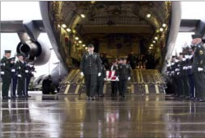
U.S. Army casket bearers carry the remains of one of six U.S. Servicemen killed (Released)