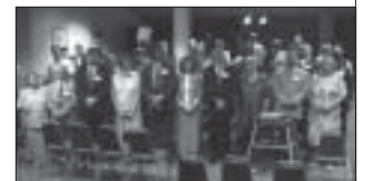
26 Candidates came from all over the country to be ordained and licensed.