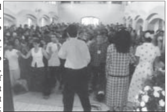
Skilled musicians and singers lead wonderfully joyful praise and worship services at the "Tabernacle of the Anointing."

As you read this, if God is touching your heart to become involved in this mission outreach by adopting a sister church in Cuba, or if you think God might be calling you to go and personally experience the abundant outpouring of the Holy Spirit there, please email me at aebarber@netzero.net .